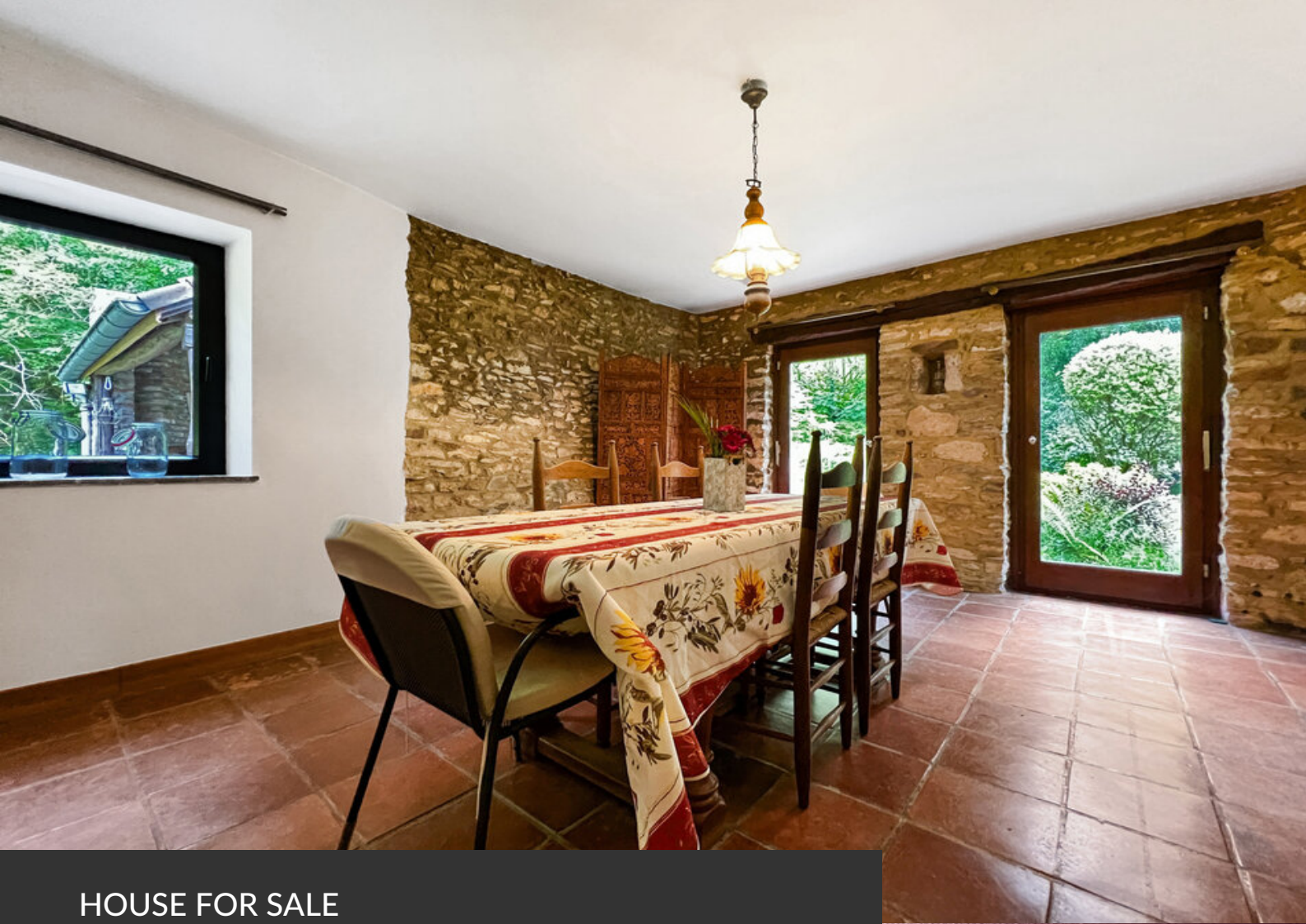
HOUSE FOR SALE OTTIGNIES